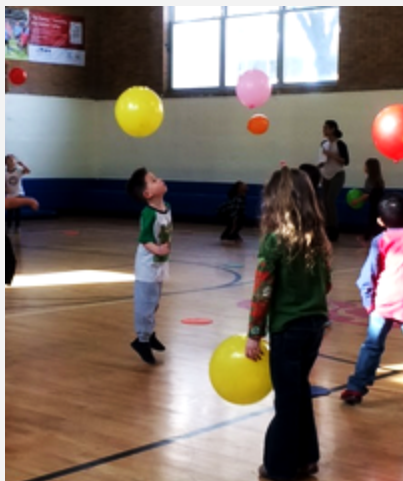
Kindergarten gym time with balloons!