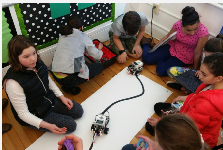
6th graders testing and timing their line-follower robots

Pre-order flowers for your talented performer today! Assortment of wildflowers are 8$ per bouquet. Pre-orders will be open until 3/15. http://www.holahoboken.org/Parents/Useful_Links/