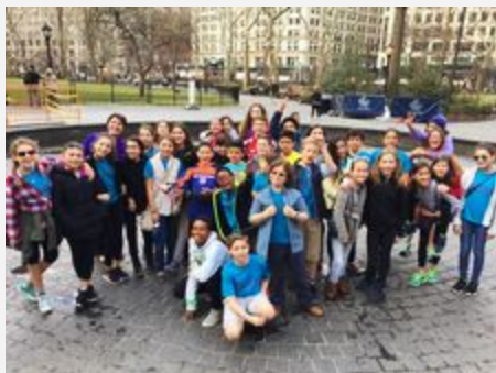
6th grade field trip to El Repertorio Español