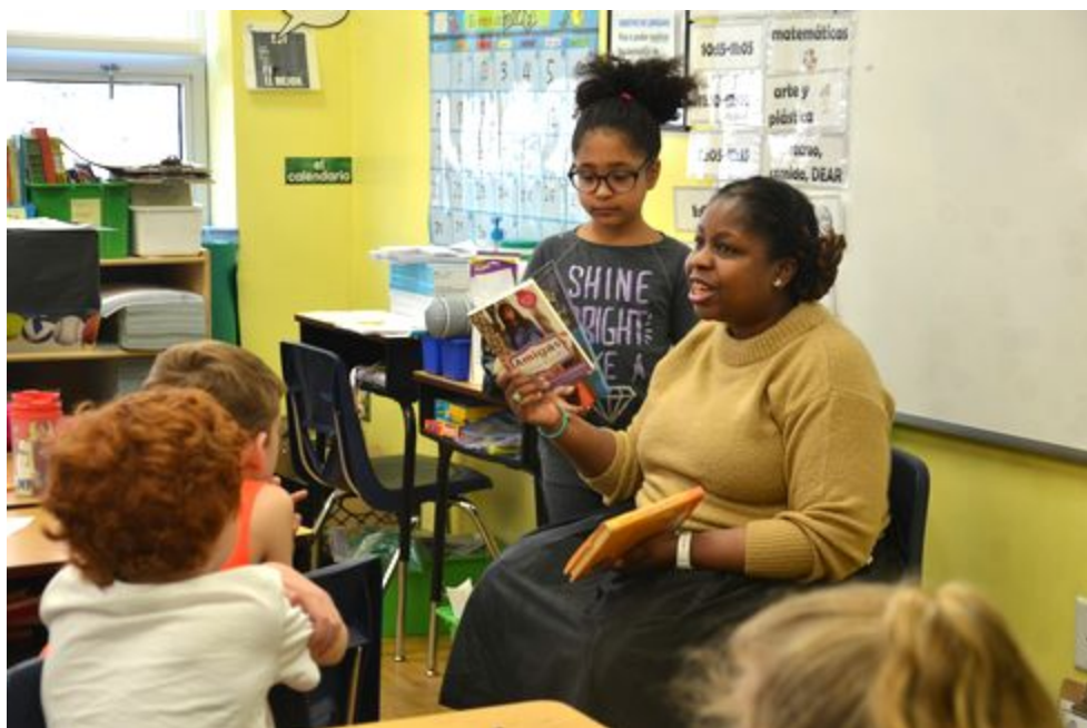
Writer/author (and HoLa parent!) Veronica Chambers visits 3rd Grade