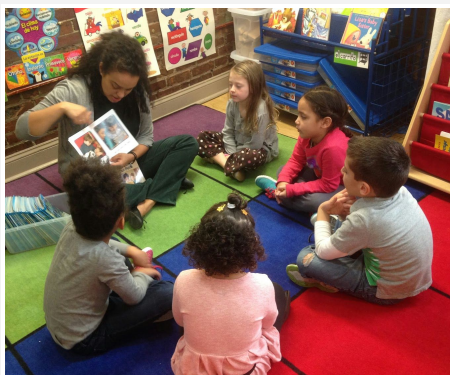
KA learning in groups!