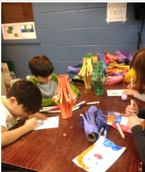
Creating paper lanterns in Art

301 Garden St, Floor 4 Hoboken, NJ 07030 Ph: (201) 222 - 0673