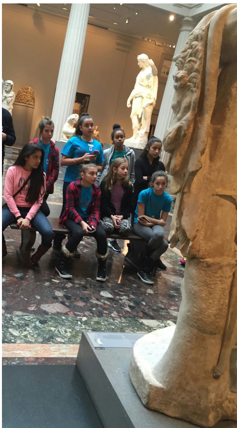
6th grade trip to the MET Museum

We will discuss upcoming events and activities. See you there!