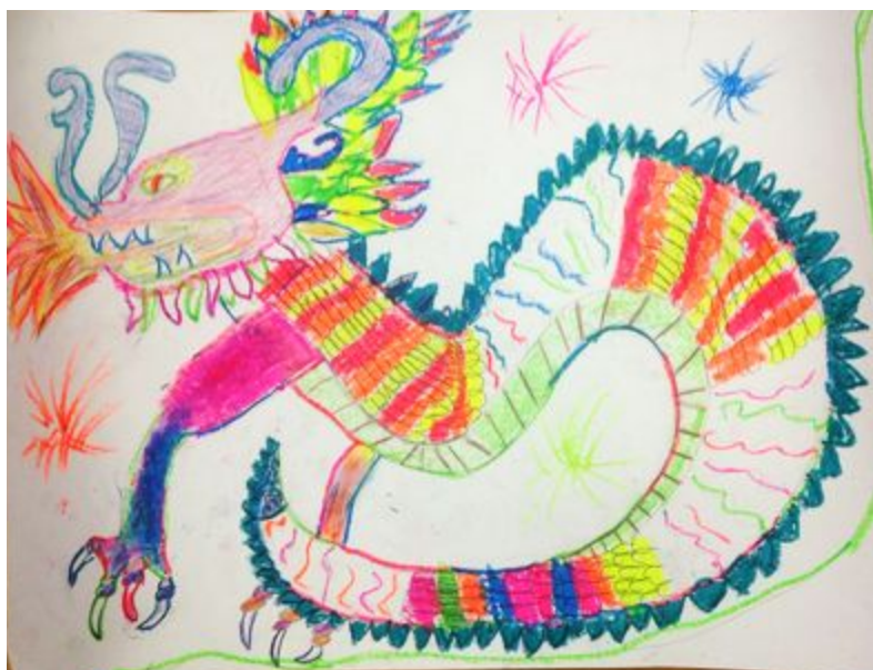
3rd Grade dragons in honor of the Chinese New Year

Feb 26 - Parents' Night Out, 8pm, Hoboken Ale House