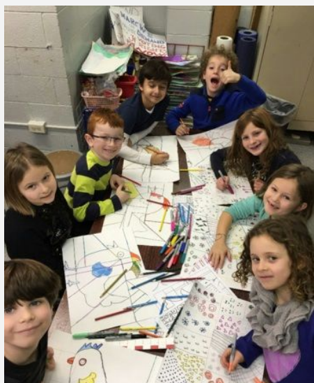
Working on Cubism in Art!

in order to participate in PE or after school gym time.