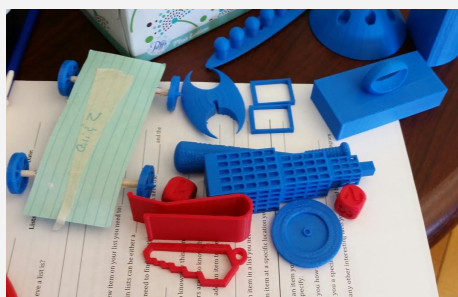
7th grade 3D Models