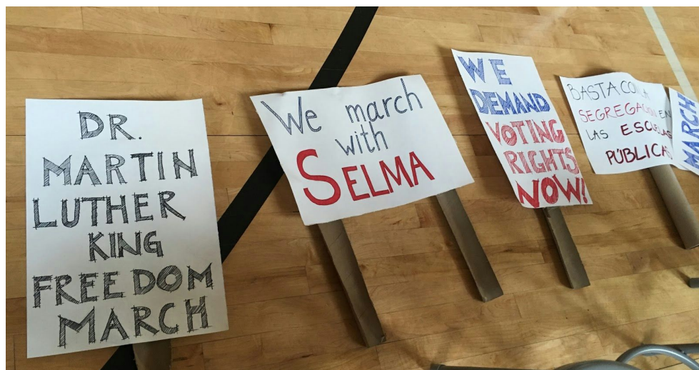
An MLK Day tribute, part of the phenomenal Third Grade Assembly today!

Feb 8 - PTO meeting, 7pm, Jefferson St Cafeteria