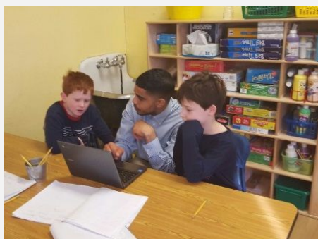
2nd Grade research on the King of Pop, Michael Jackson