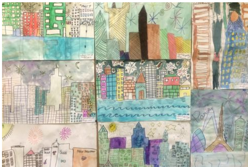
4th grade water colors