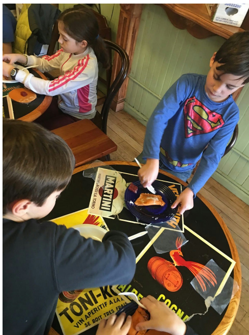
Making guava and cheese empanadas in Cooking Enrichment class

bundles for working hard on their Spanish during the contest!