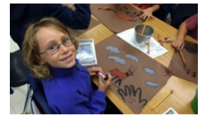
2ND GRADE Cave art