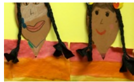
1ST GRADE "Ponchos"